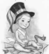
Daddy's Young Politician

The little boy replies, "The President is screwing the Working Class while the Government is sound asleep. The People are being ignored and the Future is in deep crap!