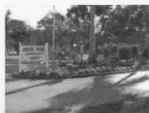
Royal Park Entranceway