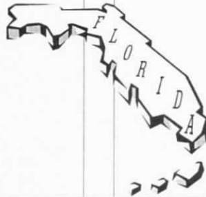
A tropical peninsula

With it's laid-back charm Marco Island is the perfect getaway. Famous for fishing and golfing it's a short drive across Tamiami Trail, hence the 6800 acre retreat is a heaven for seasoned boaters and fishermen. Accommodation is at a premium and limited to a few hotels, resorts and