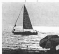
Sunset in Sarasota

For a bit of Nostalgia you can visit the home of Thomas Edison which is a museum featuring a laboratory with an array of his memorabilia and inventions. Fort Meyers was