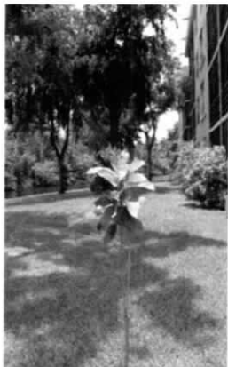
FIRST FLOWER FROM THE NEW PLANTS

name, the building and apartment number the guest will be visiting (again this is to help re-verify the correct information for your protection), and any car information (color, make, model, etc) you may have. If you do not have the car information it is not mandatory but it may take the guard a little longer if they have to input the information themselves. When your guest arrives the guards just have to pull up your name and the pass is already in the system. The guards will just have to enter the license plate number and swipe there driver's license and a pass will be automatically generated. All this will take about 30-45 seconds. This security system along with the new camera system we installed not only speeds up the lines at the gate but allow us to maintain better security for our community. I am also happy to say that with all of these improvements in our security systems we only had to increase our