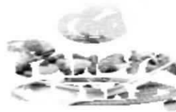
Strawberry Poppy Seed Salad

Asian Sesame Chicken: All-natural citrus-herb chicken, lettuce, fresh cilantro, sliced almonds, sesame seeds, crispy wonton strips, reduced-sugar Asian sesame vinaigrette.