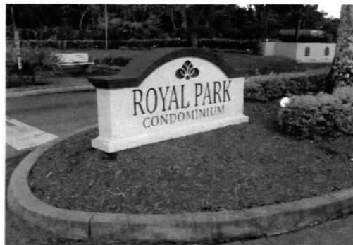
NEW ENTRANCE PLAQUE