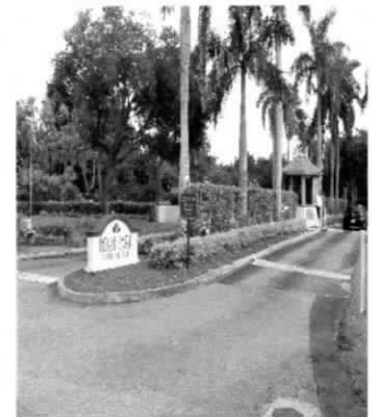
New look of Royal Park Gate