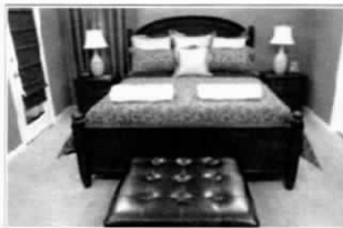
Before & After Pictures of Niecy's makeover

Often , the family becomes emotional and cynical about the junk it has harbored for years, and Niecy and her team will negotiate and make deals with family members in order to convince them to sell their belongings. The excess possessions are sold at a yard sale (often while family members weep, whine, or try to take items back into the house) to raise money for the makeover.