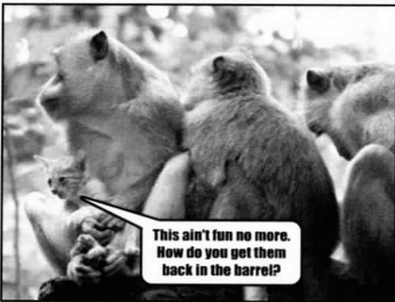
Dreams of Animals