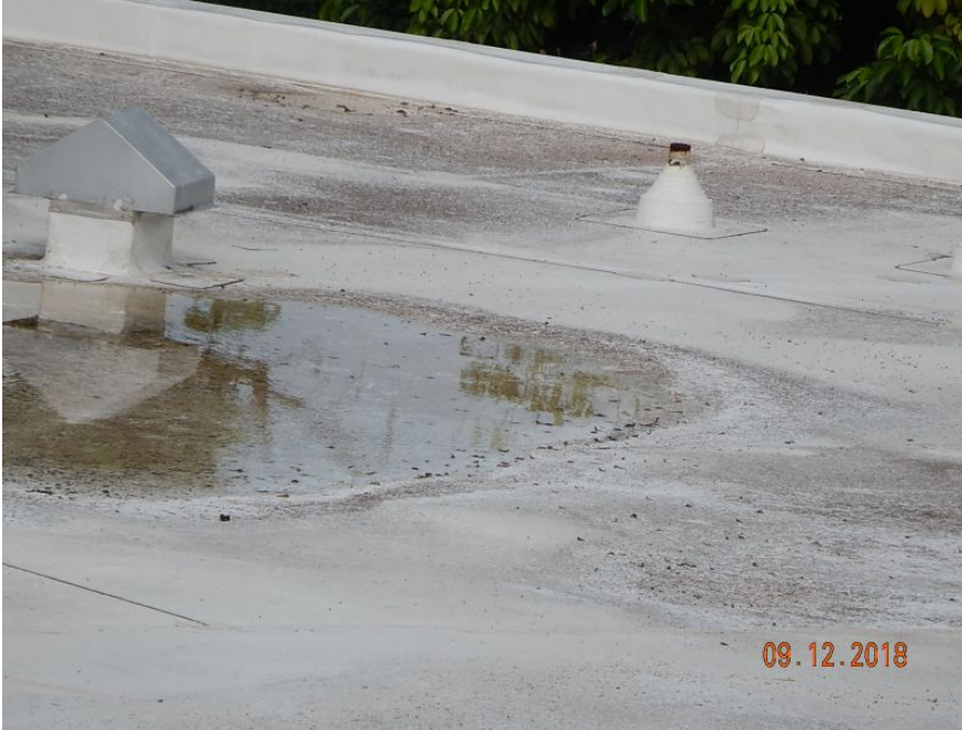
Built-Up/Rolled Asphalt Roof Covering