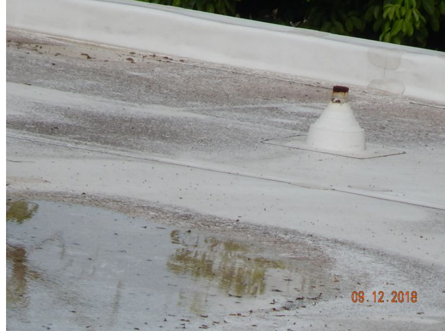
Built-Up/Rolled Asphalt Roof Covering