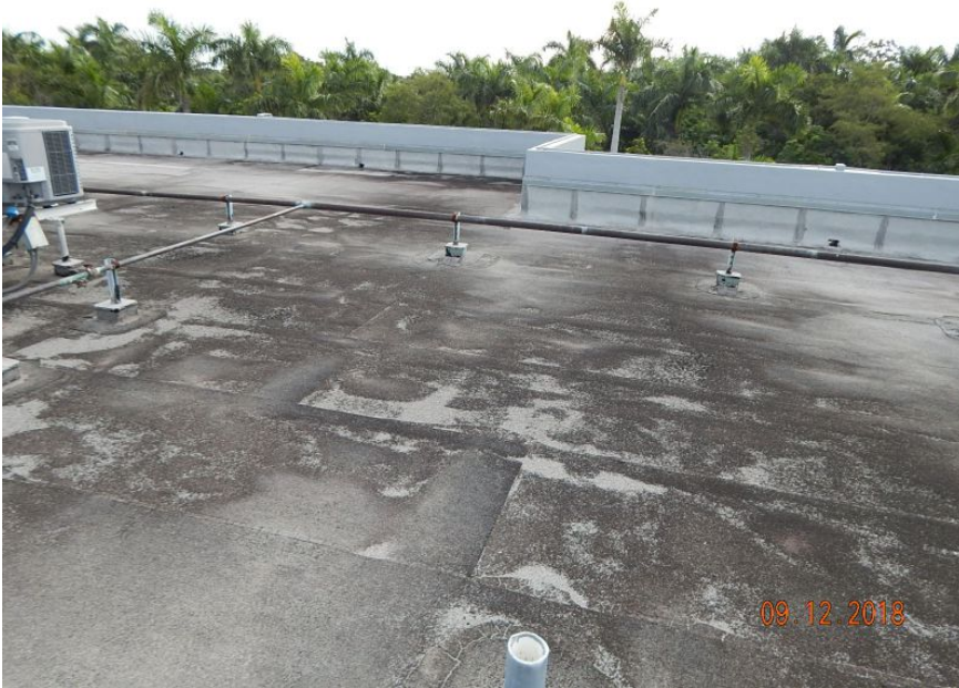
Built-Up/Rolled Asphalt Roof Covering