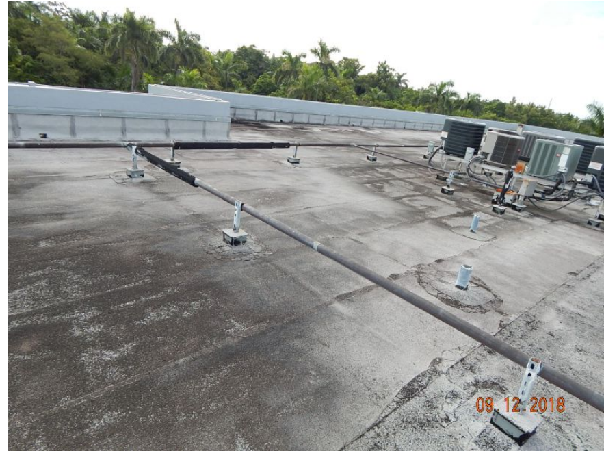
Built-Up/Rolled Asphalt Roof Covering