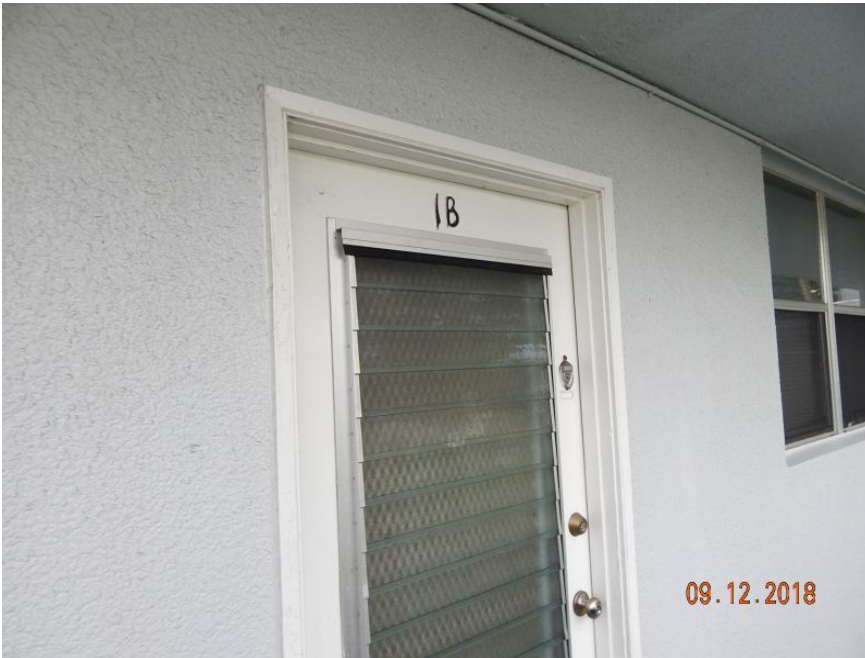
Unprotected Glazed Door